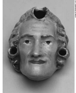
An inkwell bearing the likeness of Voltaire, displayed in Jefferson's Bed Chamber.