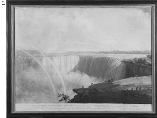
An engraving of Niagara Falls, displayed in the Dining Room of Monticello.