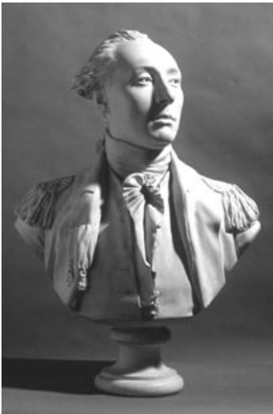
Bust of Lafayette (copy after Jean-Antoine Houdon, 1786).