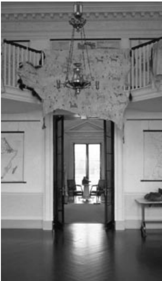
Looking into Monticello's Parlor from the Entrance Hall.