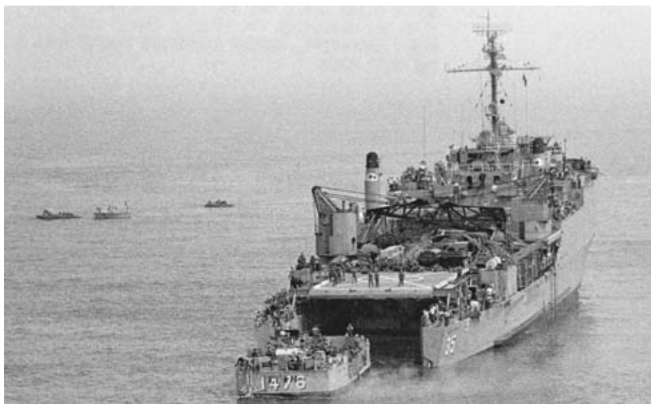
Naval Historical Center

Additional information about these ships is available on the Naval Historical Center's Web site, www.history.navy.mil .