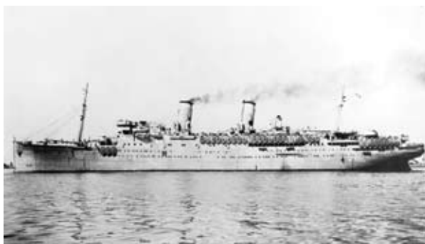
Naval Historical Center