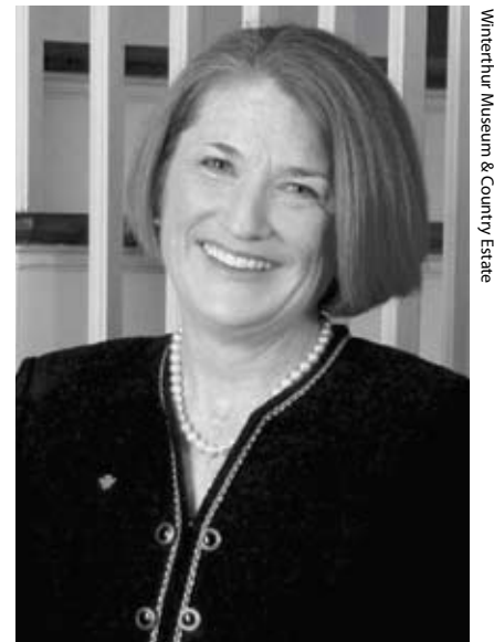
Winterthur Museum & Country Estate