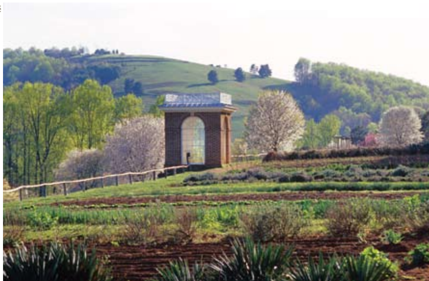
A springtime view of the Vegetable Garden, looking toward Jefferson's Montalto.