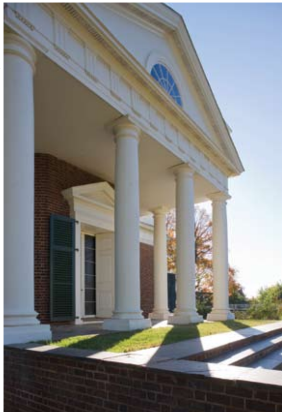
An autumn view of Monticello's iconic West Portico.